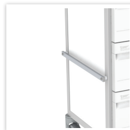
ALUMINUM ACCESSORY RAIL (ART-SRAIL-E)