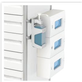
TRIPLE GLOVEBOX HOLDER (TR-GBH-ABS)