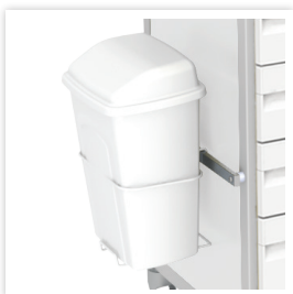
WASTE BASKET (CRTA-WSBIN)