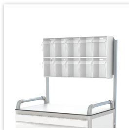
TILT-BIN HOLDER 2 (ART-TBH-2)